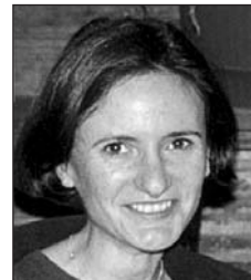
By Ksenia Kanavitsa