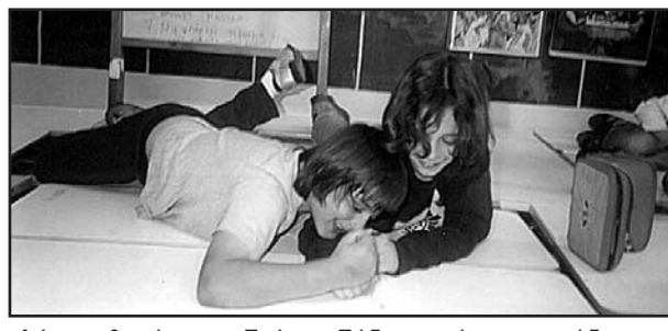
Δύο μαθητές της Τρίτης Τάξης ενώ συνεργάζονται για να ζωγραφίσουν με το ένα χέρι.